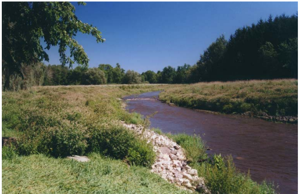
A STREAM IN WISCONSIN RESTORED THROUGH DAM REMOVAL

Deciding whether or not to remove a dam can be difficult. The complexity of the decision is compounded when the dam still serves some purpose, such as facilitating water diversions. While dam removal may not be the right decision for every situation, hundreds of harmful dams have been removed across the country, and when necessary replaced with one or more of the numerous non-structural and low-impact options described in this report. In researching and writing this report, it became abundantly clear that the real alternative to many dams in the United State involves policy and behavioral changes that reduce the fundamental demand for the services that dams can provide. It is our hope that practitioners, decision-makers, and interested citizens will use this report not only as a resource to help replace a function of an existing harmful dam, but also as a stepping point to begin the larger dialogue about how better to manage our rivers and other limited resources.