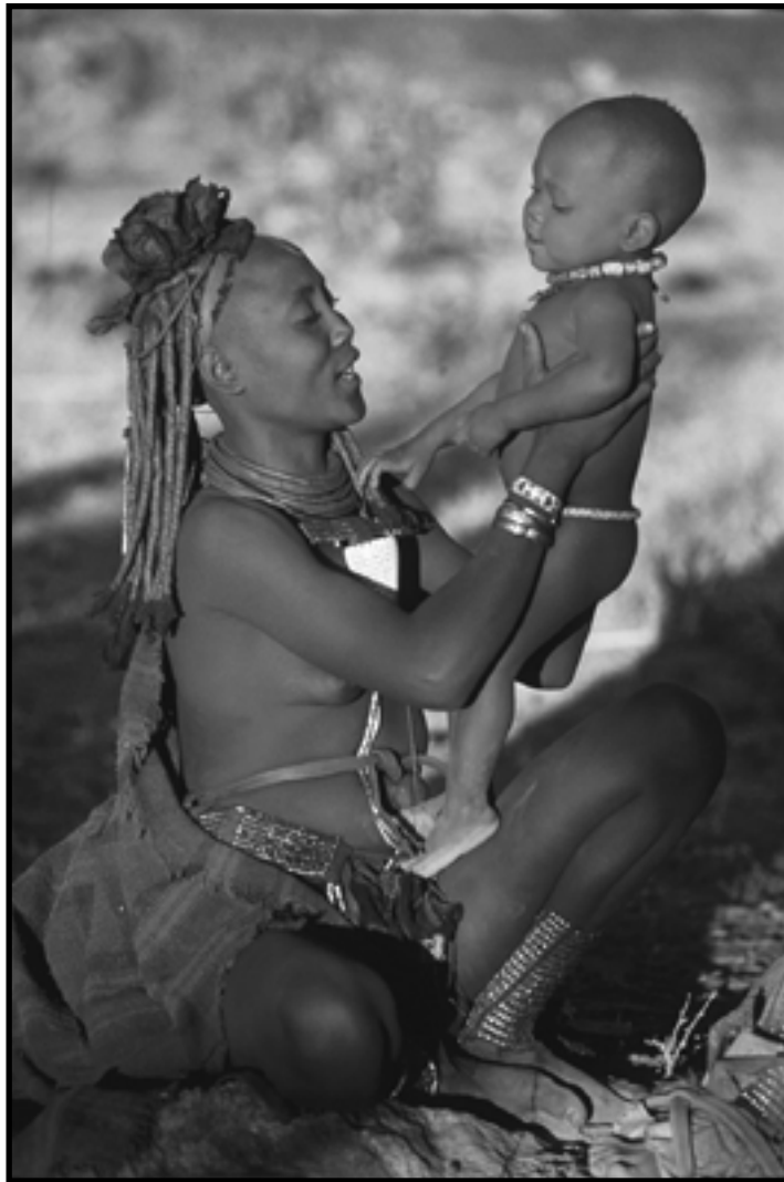
These Himba people could be displaced by Epupa Dam.

At a January 28 meeting with Nampower and US officials, the Namibian government said it wants to