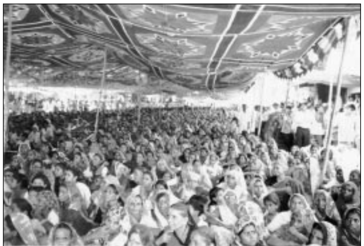
Affected people rally against dams in the Narmada Valley.