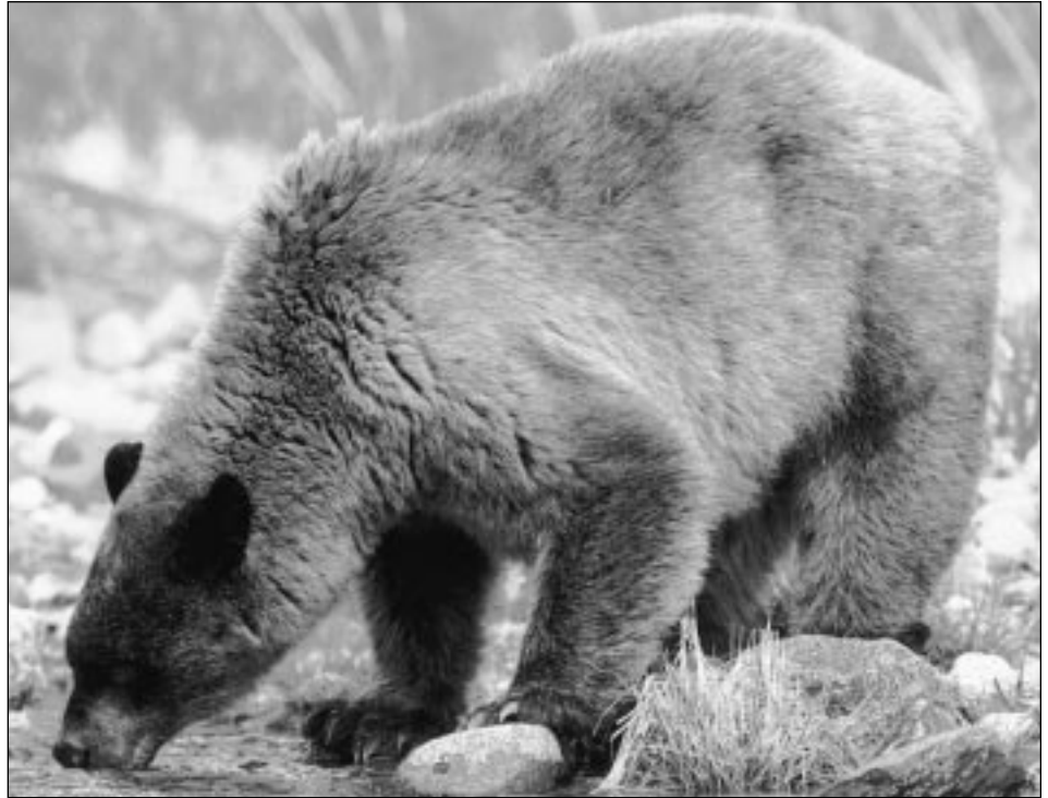
Healthy rivers depend on the workings of animals, both large and small. Bears are a key element to Pacific rivers.

Looking at one of the rivers flowing out of the mountains of the North American Pacific coast, you will be struck by the immense amounts of woody debris that litter the flow. Trunks and branches abound, twigs and