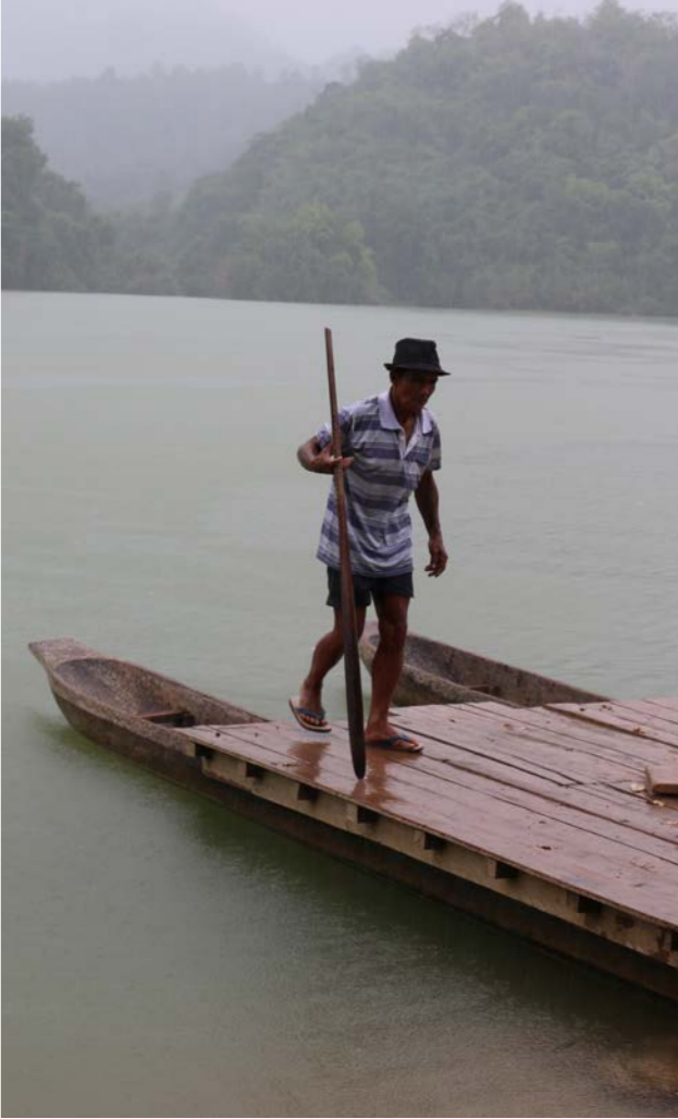
An area known as the ‘Thousand Islands’ on the Pang River, a tributary of the Salween in Shan State, Myanmar. The area will be inundated if the Mong Ton dam is built.

Business enterprises must conduct “due diligence” to comply with the UN Guiding Principles. Due diligence is both a standard and a process. It requires that the business takes steps to identify, stop or reduce human rights impacts against local people and remedy those that have already occurred. This process must be ongoing, proactive and reactive so that companies can ensure that they respect human rights and do not contribute to conflict. 44 Doing due diligence as part of an ongoing process is important in conflict-affected areas like Myanmar where the transition to democracy and the peace process have just begun and outbreak of conflict is unpredictable.