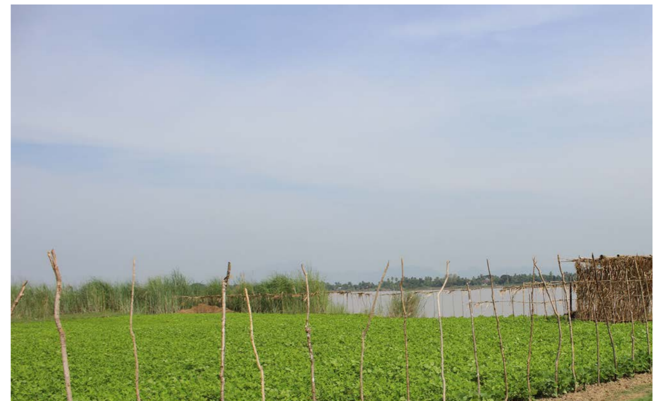
A community-owned plantation on the banks of the Salween River, at Magyi Island, Paung Township, Mon State