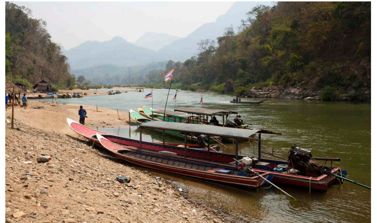
The Moei River is a major tributary of the Salween that flows from Thailand

Myanmar’s laws also enshrine several important human rights principles and procedural rights. This includes legal frameworks for environmental impact assessment, land acquisition and resettlement, and investment.