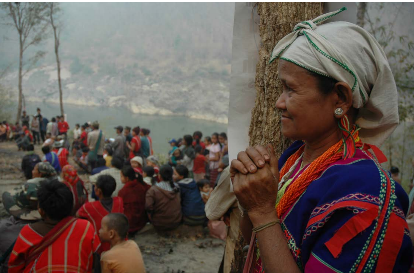
Karen ethnic villagers and allies from Thailand and Myanmar gather to pray for the free-flowing river on the International Day of Action for Rivers

The EIA Procedure also orders that projects involving involuntary resettlement, or which may have adverse impacts on indigenous peoples, follow international standards on involuntary resettlement and indigenous peoples, including the safeguard policies of the World Bank Group and Asian Development Bank . 55