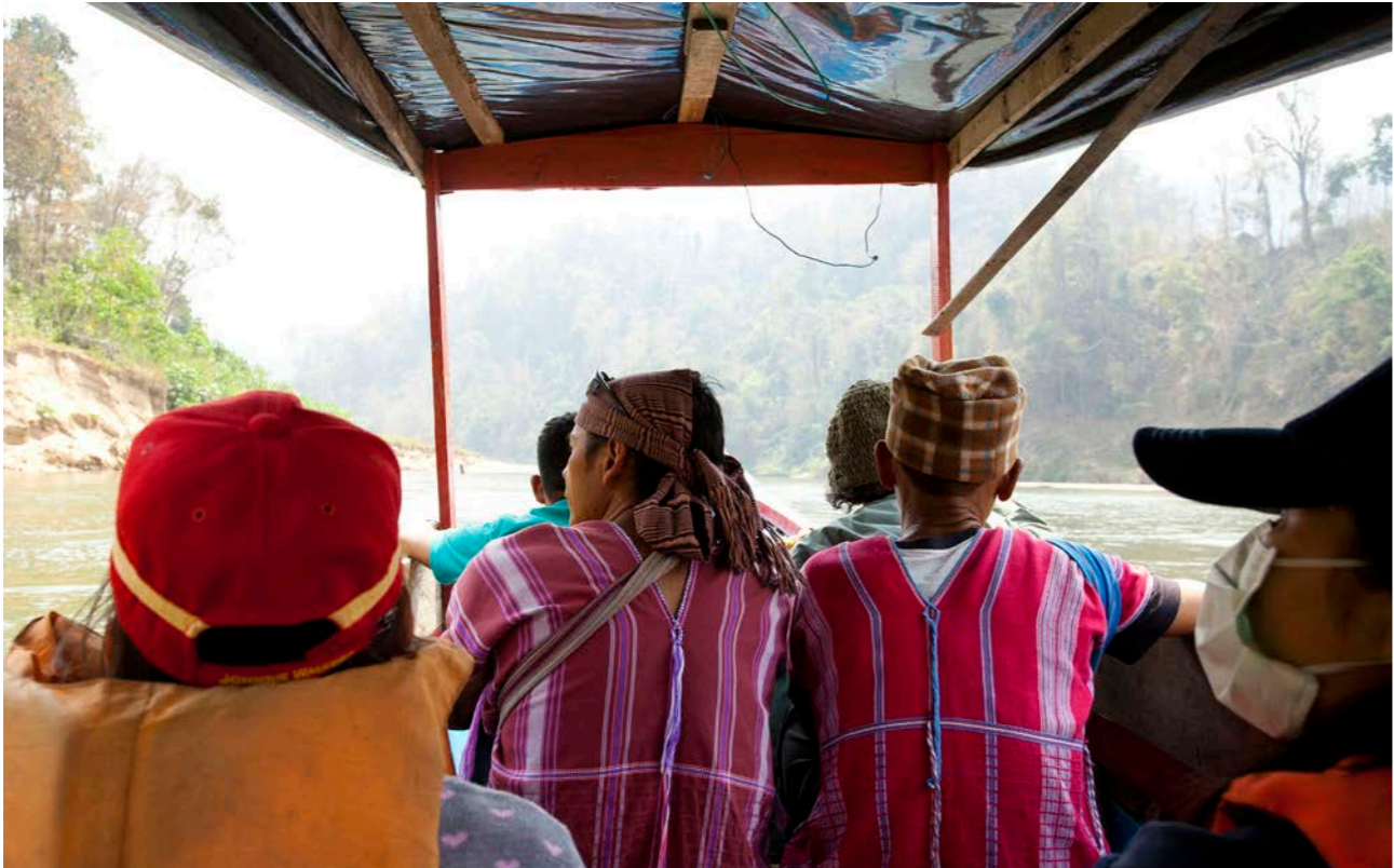
International Day of Action for Rivers, Salween River