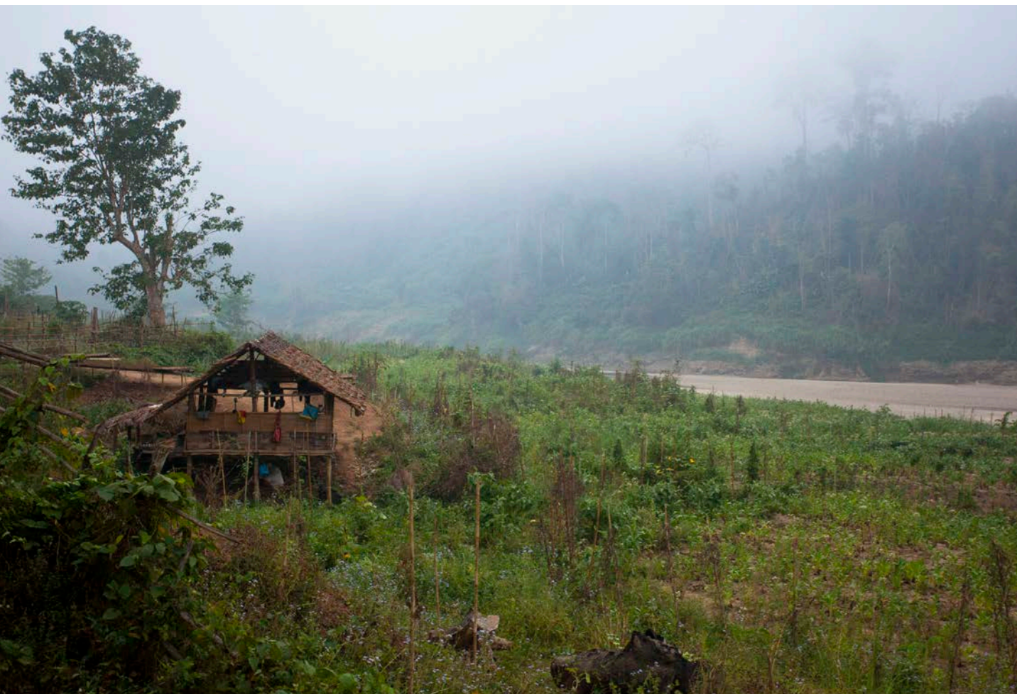
A remote village on the Salween

The leading general framework is the UN Principles for Responsible Investment . These principles are based on the understanding that environmental, social and governance issues impact investment portfolios over time and must be incorporated by investors in order for their obligations to be met. Responsible investing requires investors to be “active owners” that engage with the companies they invest in about environmental, social and governance issues in their business operations. For example, Salween project investors practicing “responsible investment” must engage with Salween project development companies about environmental, social and governance issues and risks associated with the dams.