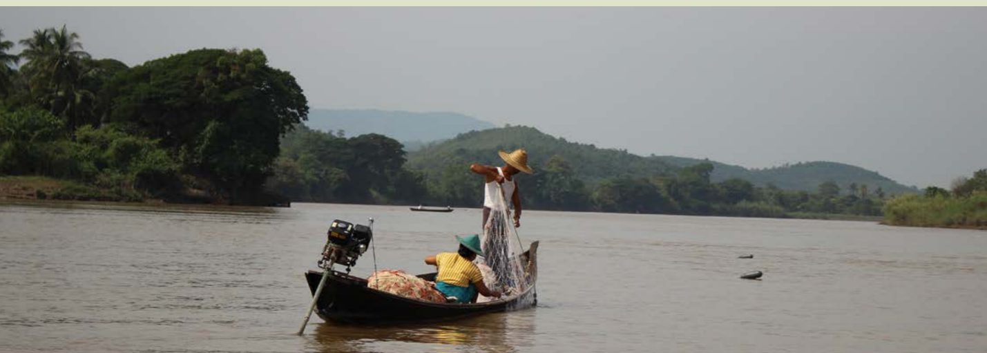
A Mon family catches fish in the Salween River at Paung Township, Mon State