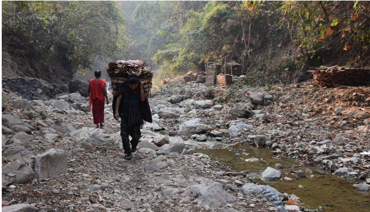
Internally displaced persons in Myanmar's ethnic states along the Salween River have been affected by militarization and human rights violations.

It is not clear that any of the Salween business stakeholders have done due diligence according to UN Guiding Principles 17–21. Close attention should be paid to how Salween business stakeholders are assessing and reducing the human rights impacts of the Myanmar armed forces, which generally provide security at dam sites, and are therefore linked to Salween business stakeholders through their operations, products or services. Companies do not have to comprehensively assess the general human rights record of the Myanmar armed forces, but must assess the risk that abuses may occur as a result of their presence at and near dam sites. Relevant factors in this assessment include: