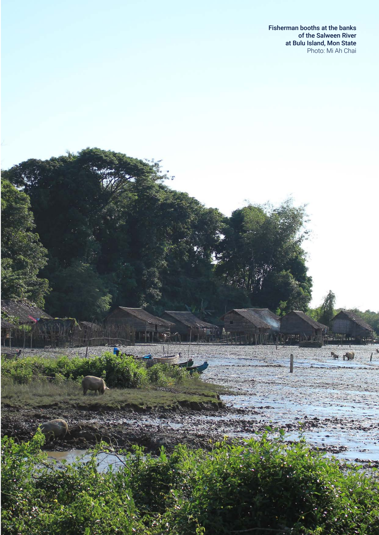
Fisherman booths at the banks of the Salween River at Bulu Island, Mon State