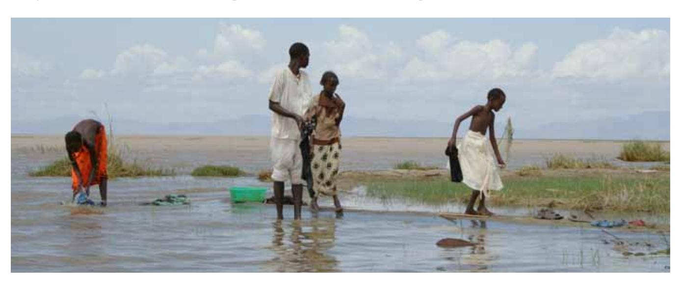
Kenya's Lake Turkana is at the heart of the lives of 300,000 people. If Gibe III is completed, the lake could shrink dramatically.

Ethiopia has huge potential for hydropower, and should be able to come up with much better projects than the disastrous Gibe dams. The country could benefit from adopting the guidelines of the World Commission on Dams, which among other things call for a thorough assessment of options for meeting energy needs before specific dam projects move forward. Ethiopia should strive to develop hydropower projects that impose the fewest impacts on its people and the environment, and ensure that future projects are well-designed, sufficiently studied, publicly debated, and follow domestic laws and regulations. Such steps would reduce the risk of development disasters like Gibe III in future.