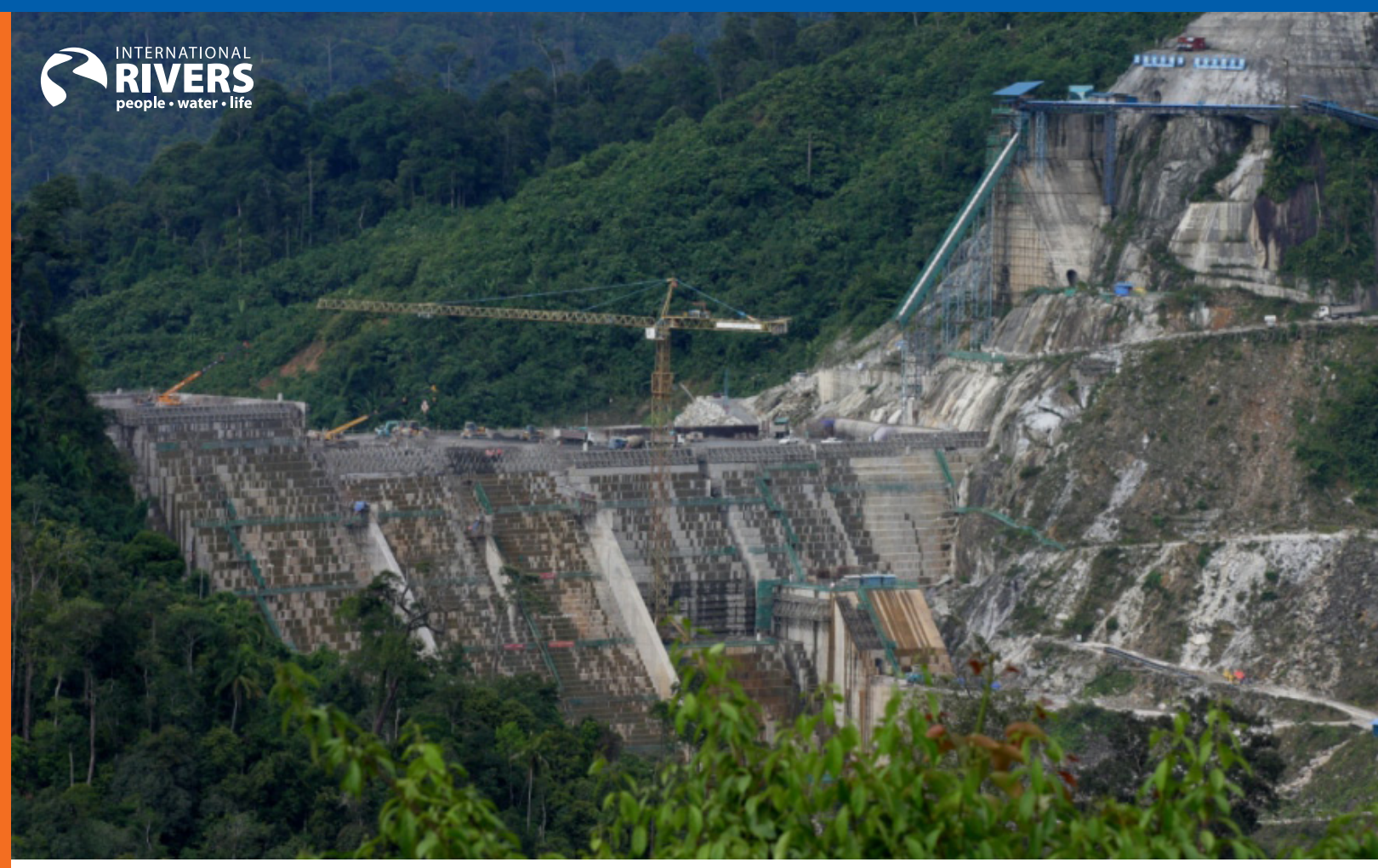
HSAP Sustainability Partner Sarawak Energy is building the Murum Dam, which will displace 1,500 indigenous people and flood vast areas of the Borneo rainforest.