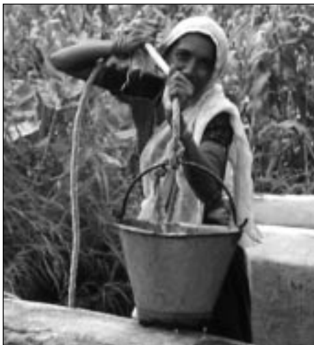
Sakarben draws water from her well.

Manubhai Mehta, a 60-year-old Gandhian dressed in the all-white cotton jodhpurs and long tunics typically worn by Saurashtrian men, heads the Center’s Water Resources Development Project. “When we started work,” he says, “water tables had dropped to around 50 or 60 feet, and in one village to 300 feet. Some of the wells were totally dry. The villages were suffering very bad short-