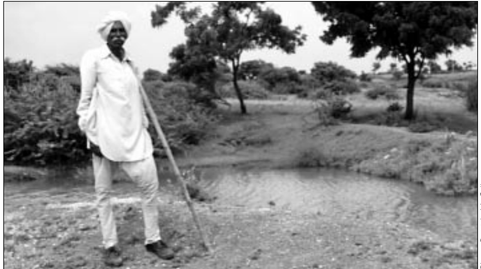
Herder from Vartoda village in front of a nala-plug pond.

The main benefit from the nala plugs, however, is not the surface water in which women can wash clothes, children can