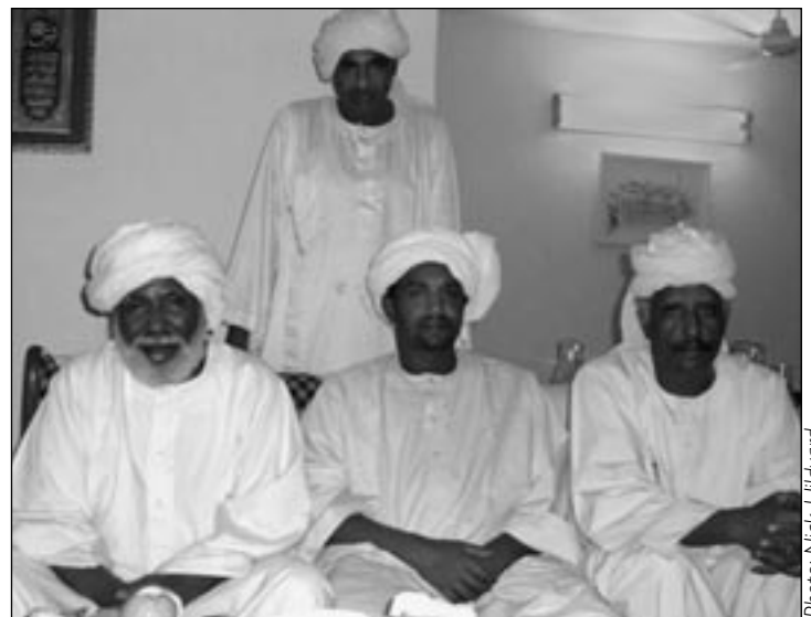
Representatives from some of the communities resettled for Merowe Dam.

Other dams on the Nile have had serious impacts on the environment. Their reservoirs have silted up, and have withheld valuable nutrients from agriculture and fisheries