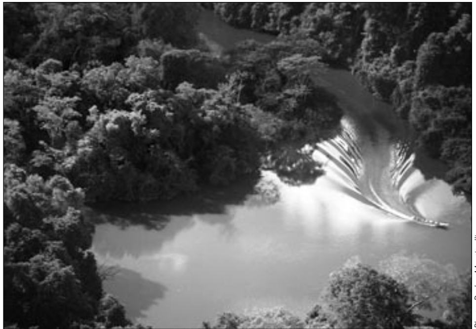
A Xingu tributary

One of the most serious impacts of the project's latest engineering design is that, rather than drowning indigenous lands, the