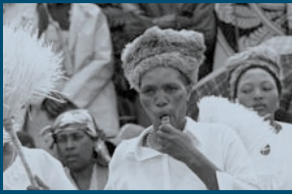
Dam-affected people in Lesotho came together on March 14.