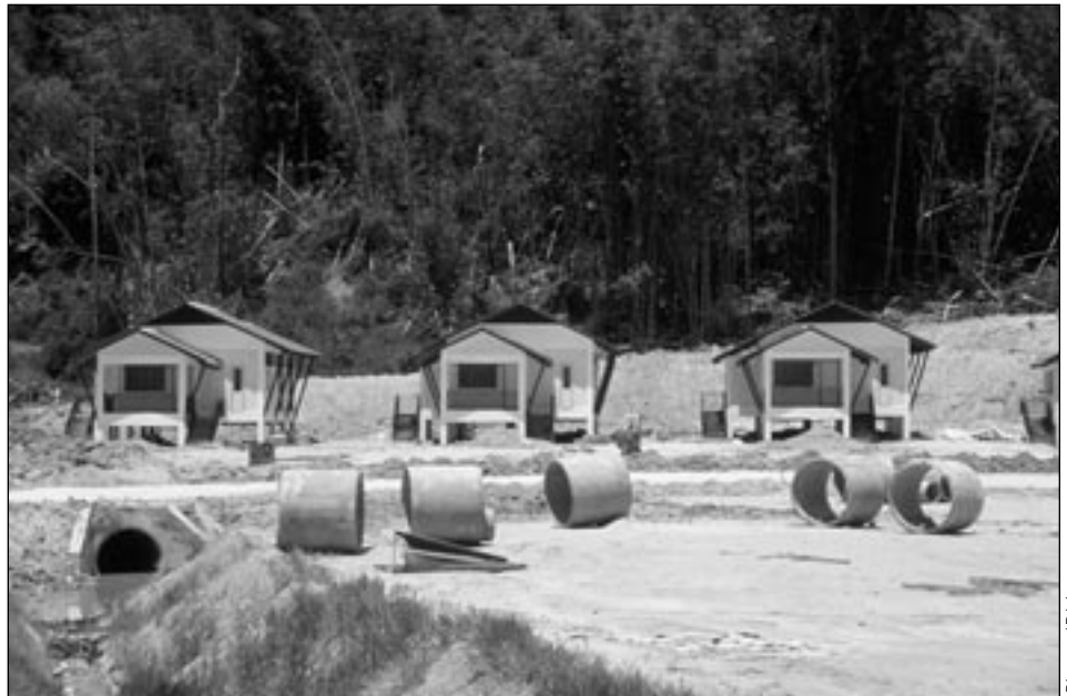
A stark new life: Resettlement site for those displaced by Sengalor Dam, Malaysia.

A fourth reason becomes salient immediately following removal, when adjusting to new habitats, hosts and government programs reduces time and energy for restoring living standards. During this period, which can be expected to last at least two years, living standards for the majority can be expected to drop. Policies based on restoration do not take into consideration the extent to which living standards have been adversely affected during those years. Nor do they consider situations where living standards have been rising outside the project area