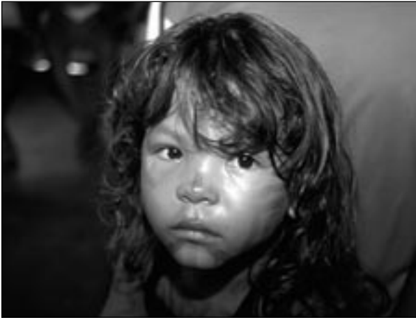
Indigenous girl, Big Bend of the Xingu.

(part of the Belo Monte complex) would divert nearly all the water which normally flows through the Big Bend of the Xingu River, reducing what Eletronorte has termed the “ecological flows” to between one-quarter and one-half of historic lows. This would have drastic effects on water quality and supply, vegetation, fish, navigation, and human health in the Big Bend area.