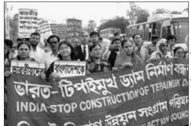
A road march in Bangladesh to protest Tipaimukh Dam.

Without getting into how poorly prepared the Environmental Impact Assessment and the Environmental Management Plan were, what emerged was an unmistakable message from the villagers of Mizoram state that these indigenous peoples will not sacrifice their land and water to an outside dam builder. One participant said, "Ours is not just any land; it is ancestral land," and stated that no land will be transferred to NEEPCO for any kind of development. In addition to conducting another hearing (this one was so flawed that even some local officials