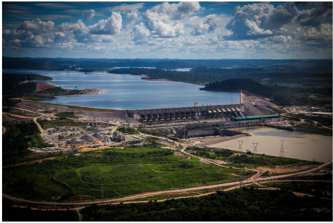
Aerial view of the Belo Monte hydroelectric plant

The social and environmental impacts generated by the construction and operation of the Belo Monte hydroelectric dam have triggered discussions regarding the capacity of local ecosystems to endure yet another large-scale venture such as the Belo Sun project.