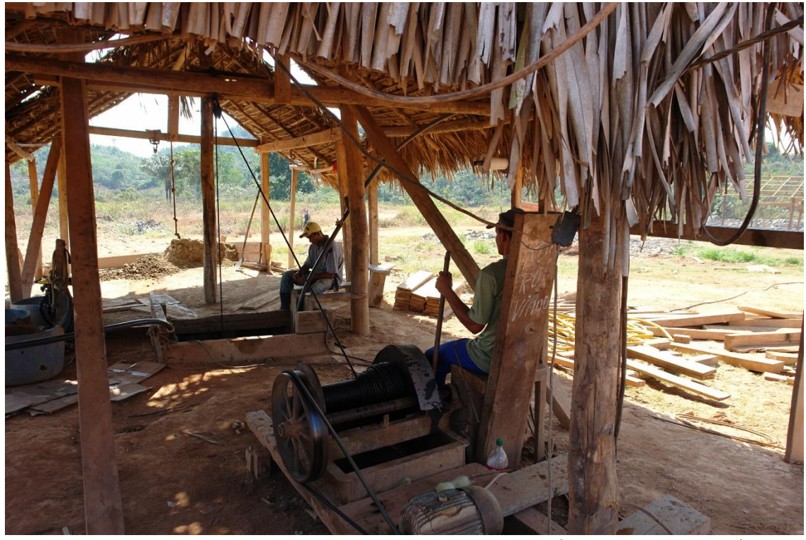
The artisanal miners of Vila da Ressaca have been expelled

The map of the communities that the Belo Sun Mineração Ltda. Volta Grande project could potentially affect is naturally as diverse as the inhabitants registered as residing along this stretch of the Xingu River.