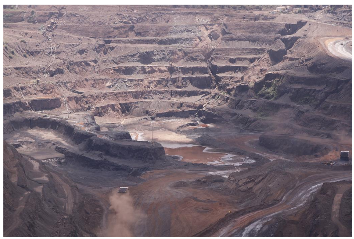
Open cast mine in Pará

Belo Sun promises that the impacts of mining activities on the Xingu River's Big Bend region will have positive impacts – such as creating jobs and generating tax revenue for the state – and that the mine's negative impacts will be monitored and mitigated as far as possible. Yet when these claims are weighed against the data presented in this study it can be seen that the tendency will actually be for the mine's operations to aggravate the already serious environmental social, cultural, and economic problems caused by the Belo Monte dam.