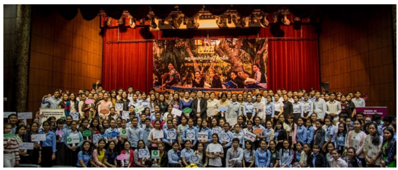
Participants at the 2019 Women and Water Dialogue in Cambodia convened by Oxfam.

Similarly, a woman's professional networks are central to her ability to rise up through the ranks, assume a degree of leadership, and ultimately influence policy. This brings to mind the example of the Lao Department of Water Resources, where informal networks inside and outside the department (the latter through connections with the Lao Women's Union, for instance) helped to support women professionals working in the water management space. Support came in the form of further professional training opportunities and knowledge exchange (e.g. alerting one another to national laws that protect women's rights) (Anonymous, Laos, February 7, 2020).