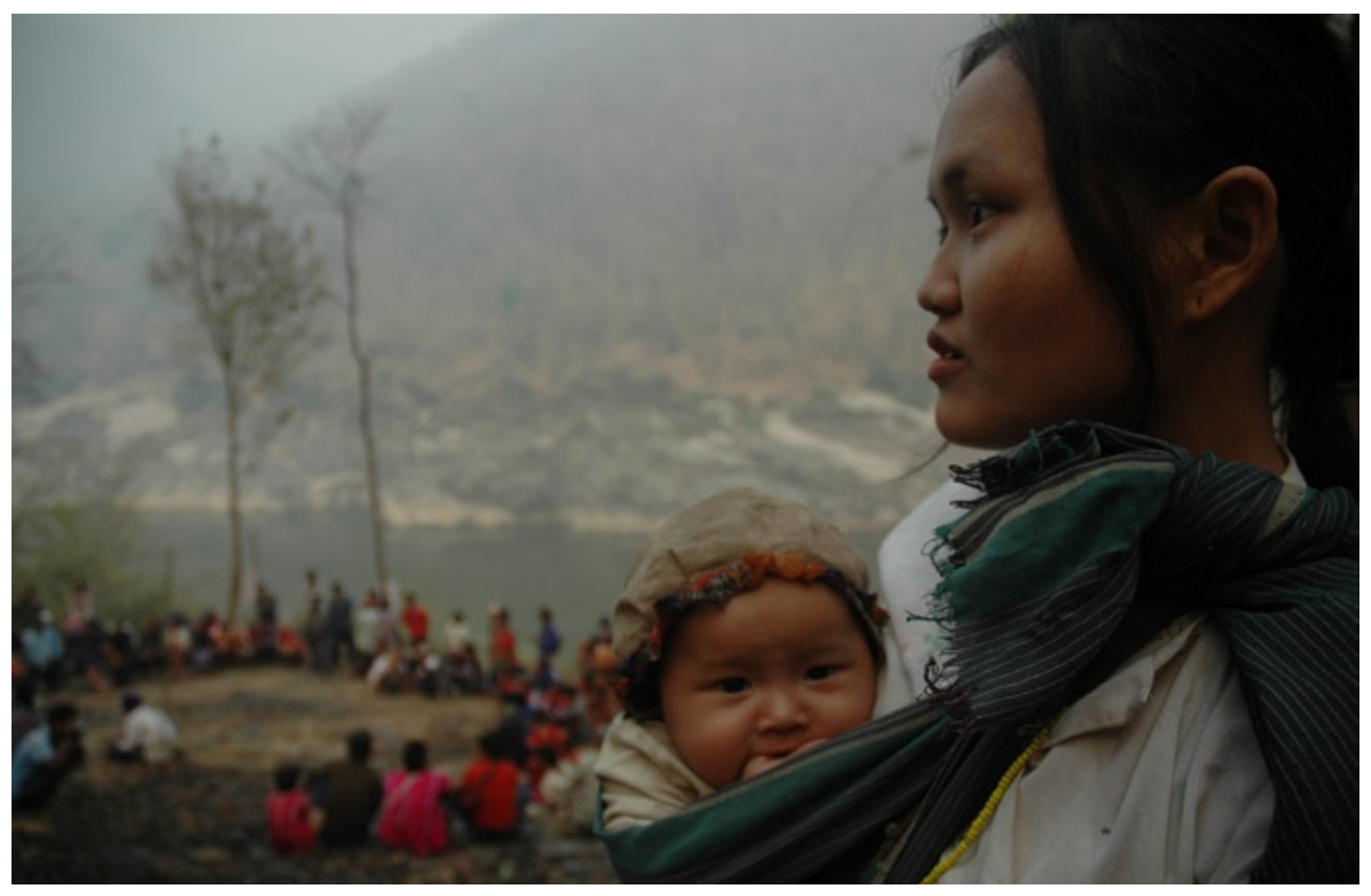
A Karen woman at the International Day of Action for Rivers on the Salween River.