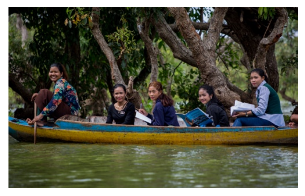
Young women participants attend a Regional Youth Exchange Storytelling Workshop in Siem Reap.

Another opportunity for building knowledge and bridging tacit and technical expertise is the process of knowledge co-production. Co-production of knowledge can happen when people who have different understandings of issues create a consensus on terminology and management approaches. Simply jointly defining "what is water" and "what are wetlands" can open up dialogue and understanding, which in the case of the Khon Taam Association led to the joint development of a management plan with local authorities.