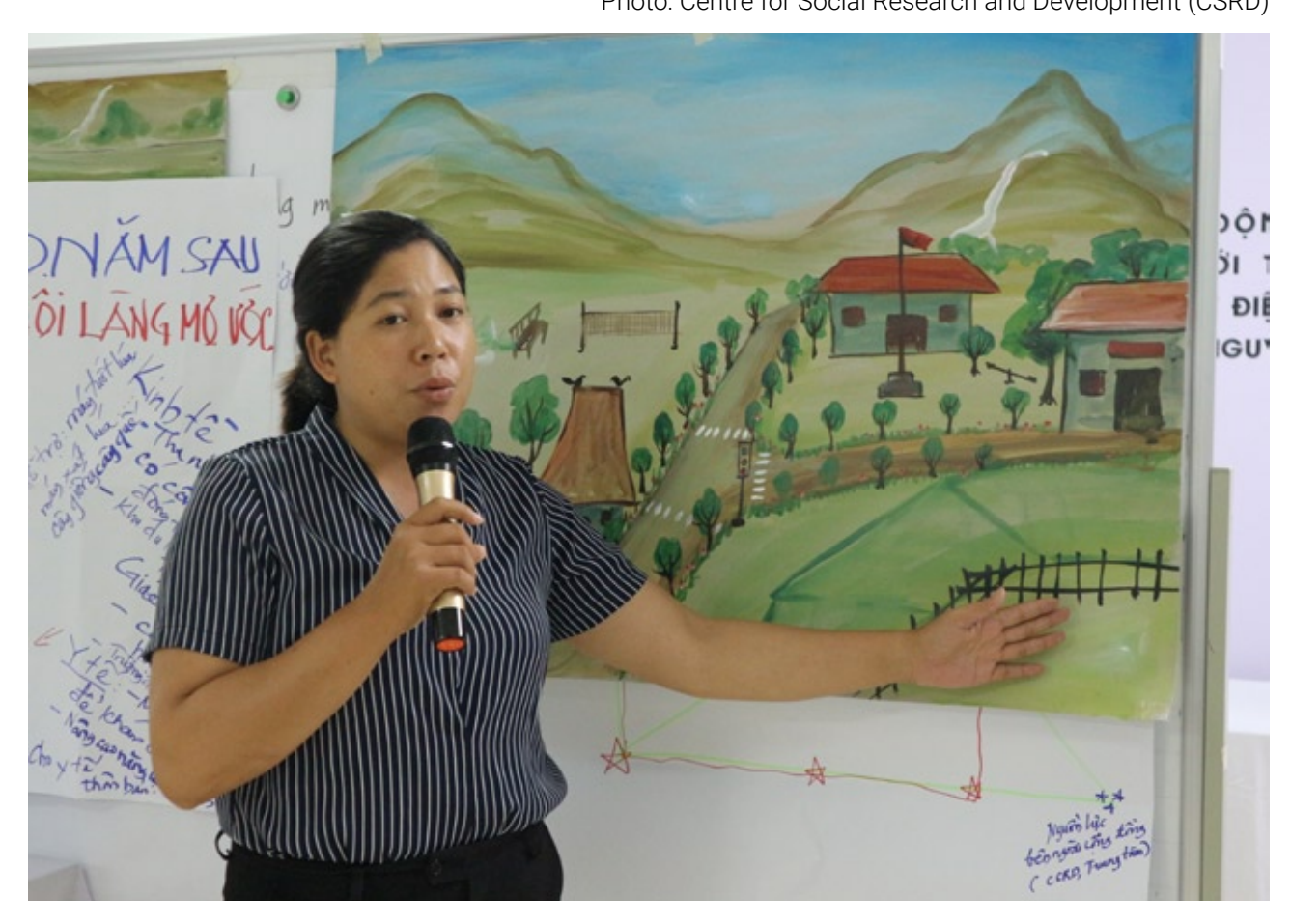
A representative of Tay Giang Women's Union sharing about her community's situation before and after resettlement due to a hydropower project in Quang Nam Province, Vietnam.

Finally, this report acknowledges the role that men can play, whether intentionally or unintentionally, in supporting and/or undermining women's agency in river governance and water decision-making. Although the research team recognizes the importance of appreciating men's roles in relation to those of women, it was a conscious decision made by the research team to prioritize women's voices and experiences, as men's voices and experiences are already well-documented.