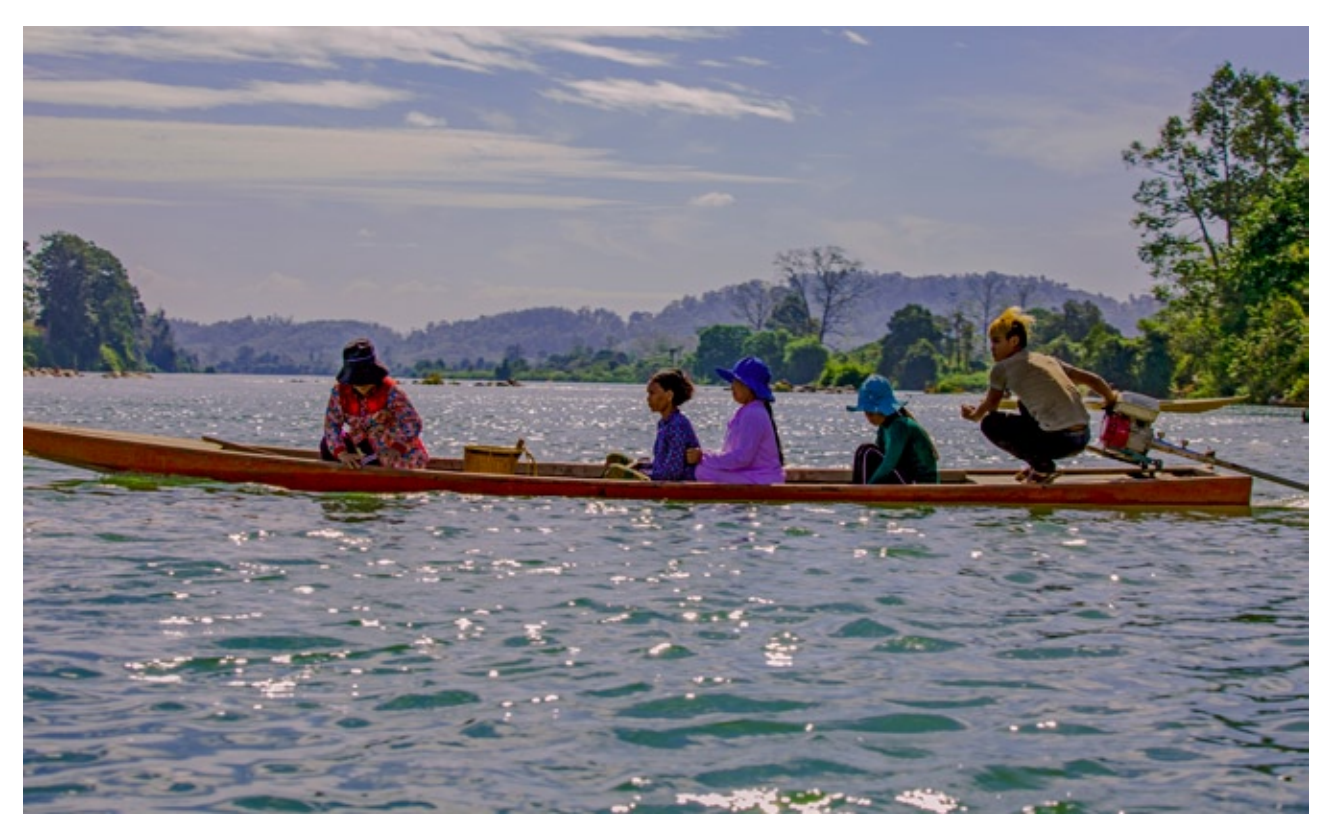
Women leaders from Padol village in Ratanakiri province, Cambodia, visit their spirit forest on Khorm Island on the Sesan River.