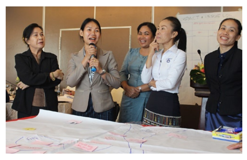
A workshop on gender impact assessment and hydropower in Vientiane, Laos.